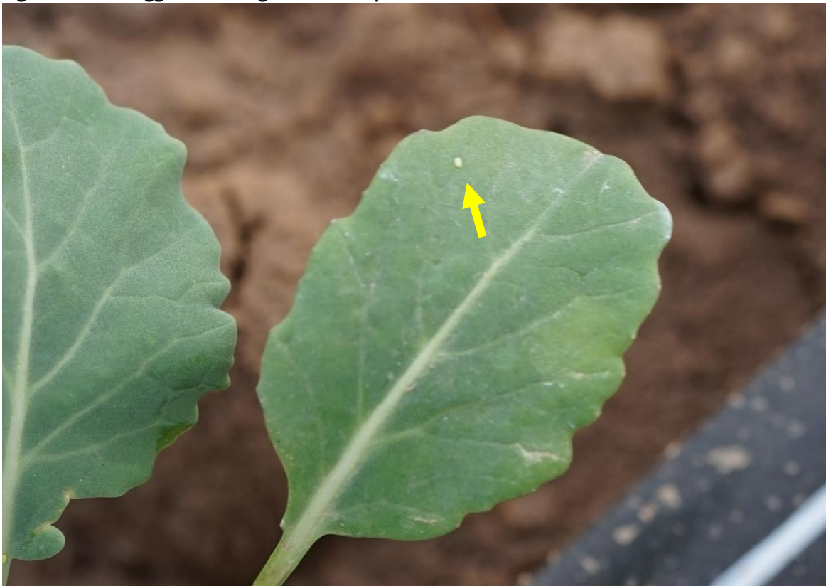
Figure 2. DBM egg on seedling cauliflower plant