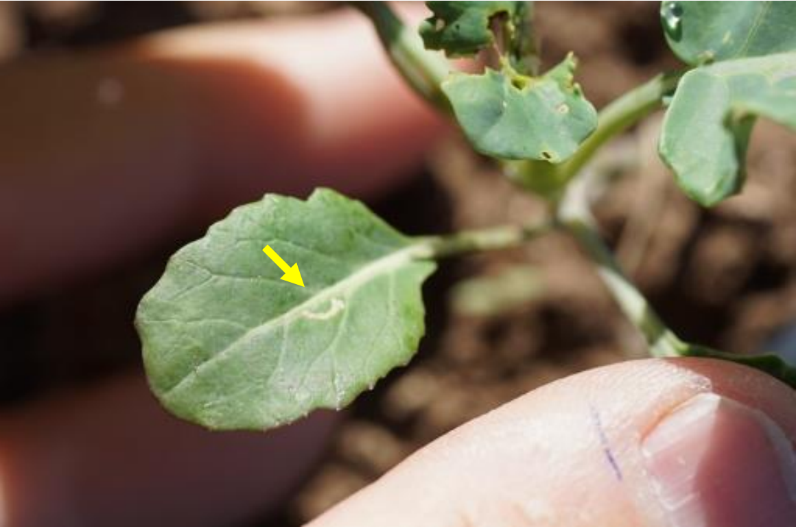
Figure 4. 1 st instar DBM larva mining in broccoli cotyledon.