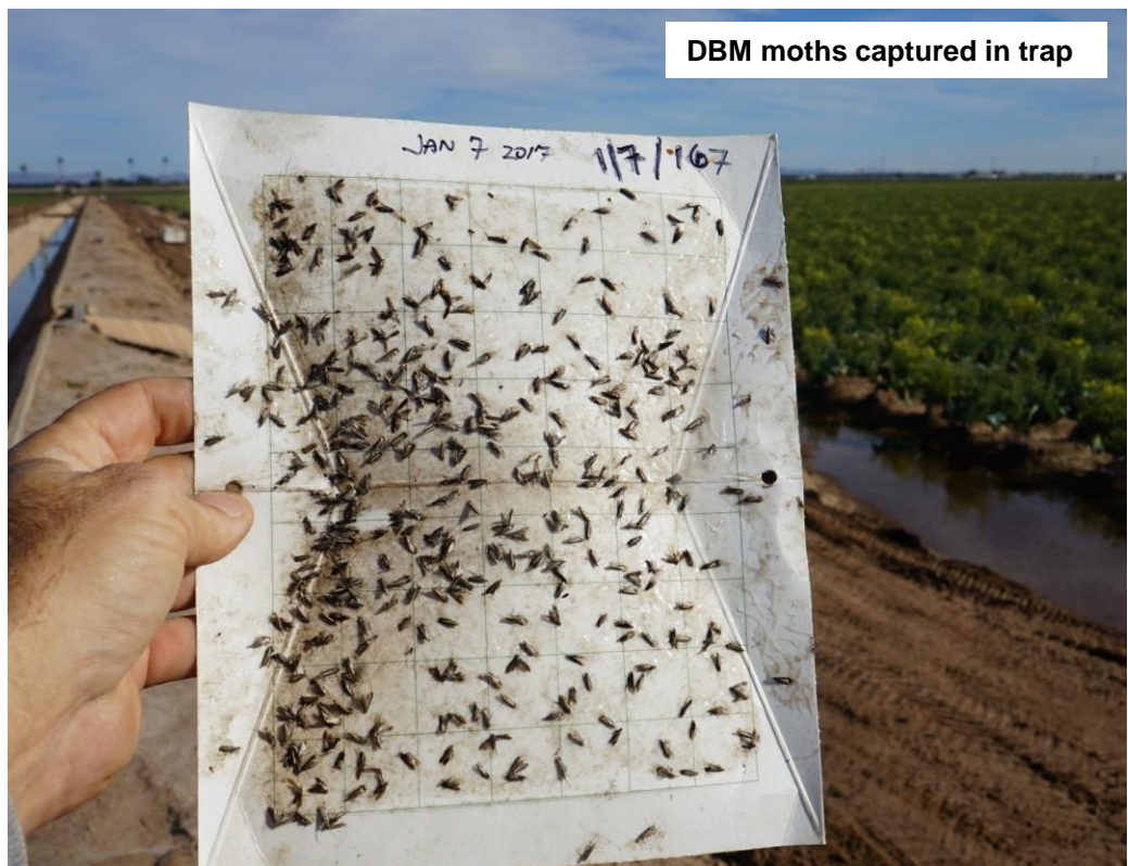
DBM moths captured in trap