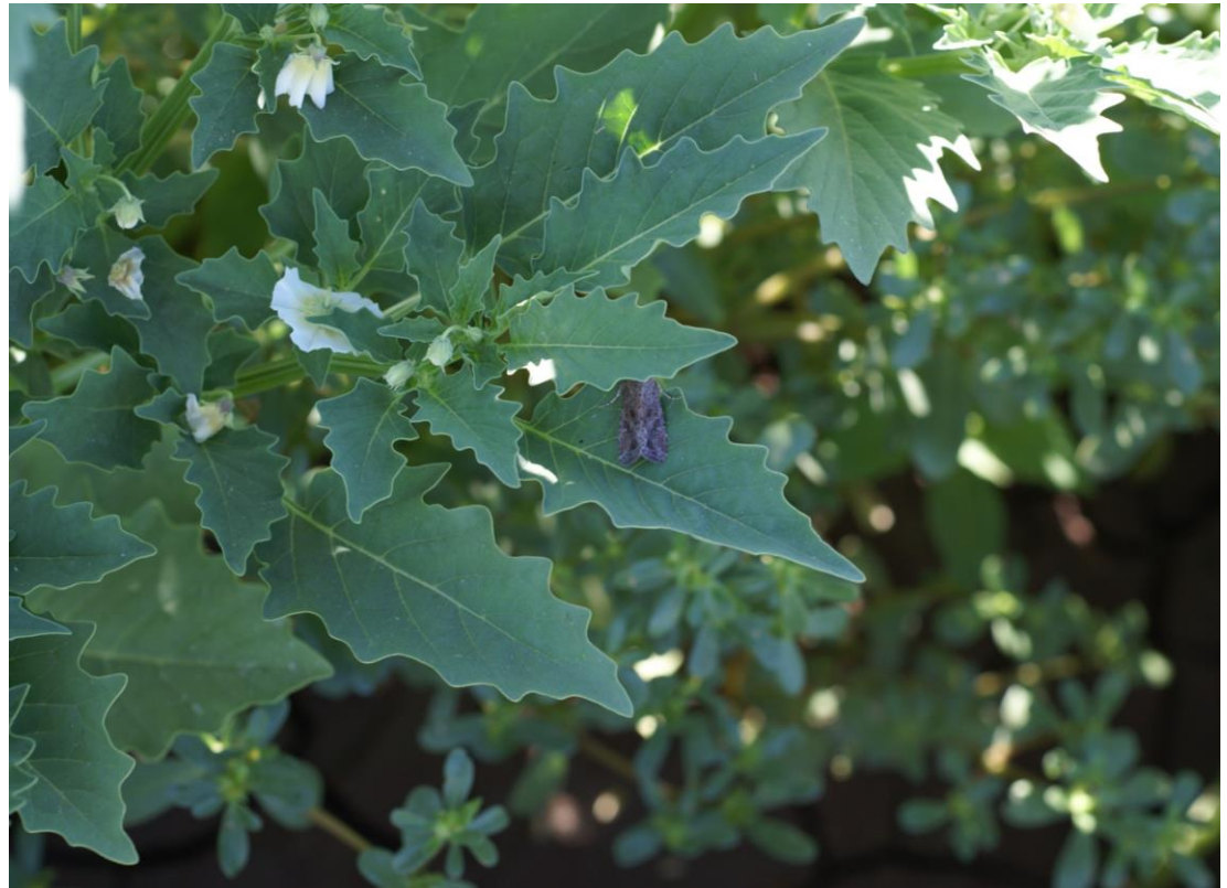
Figure 1. Beet armyworm moth finding refuge in a groundcherry plant.