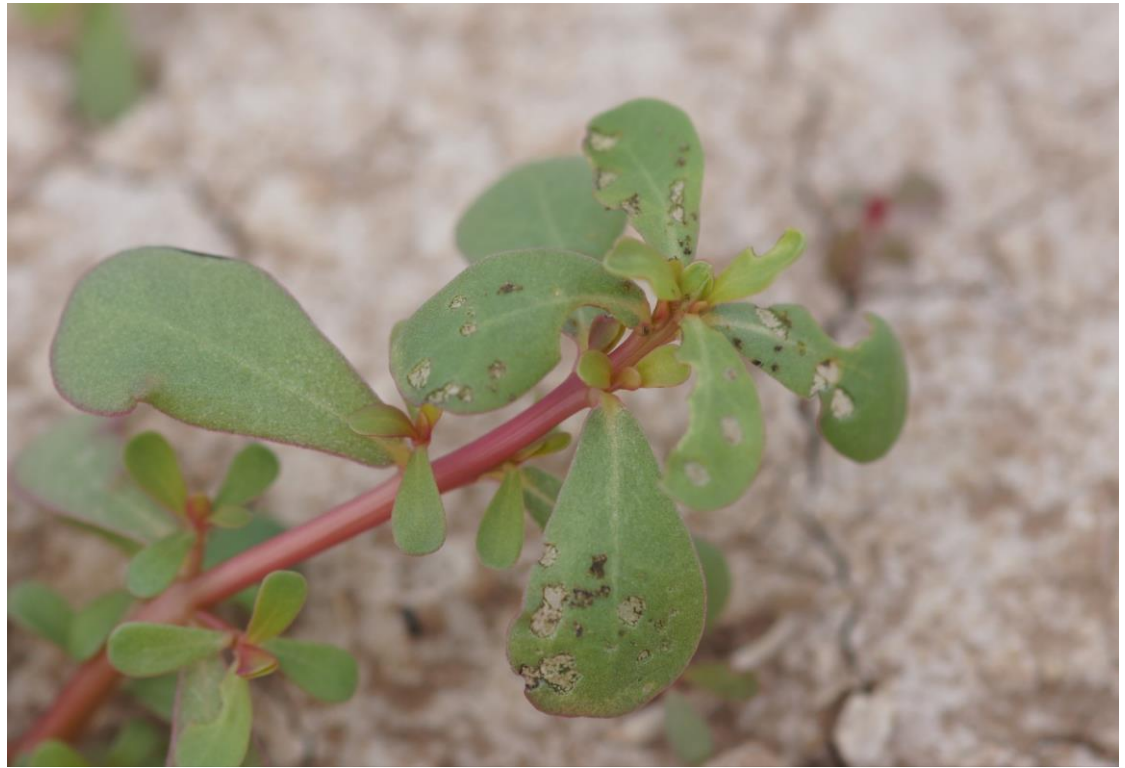
Figure 3. Flea beetle feeding signs on purslane leaves in a fallow field prior to lettuce planting.