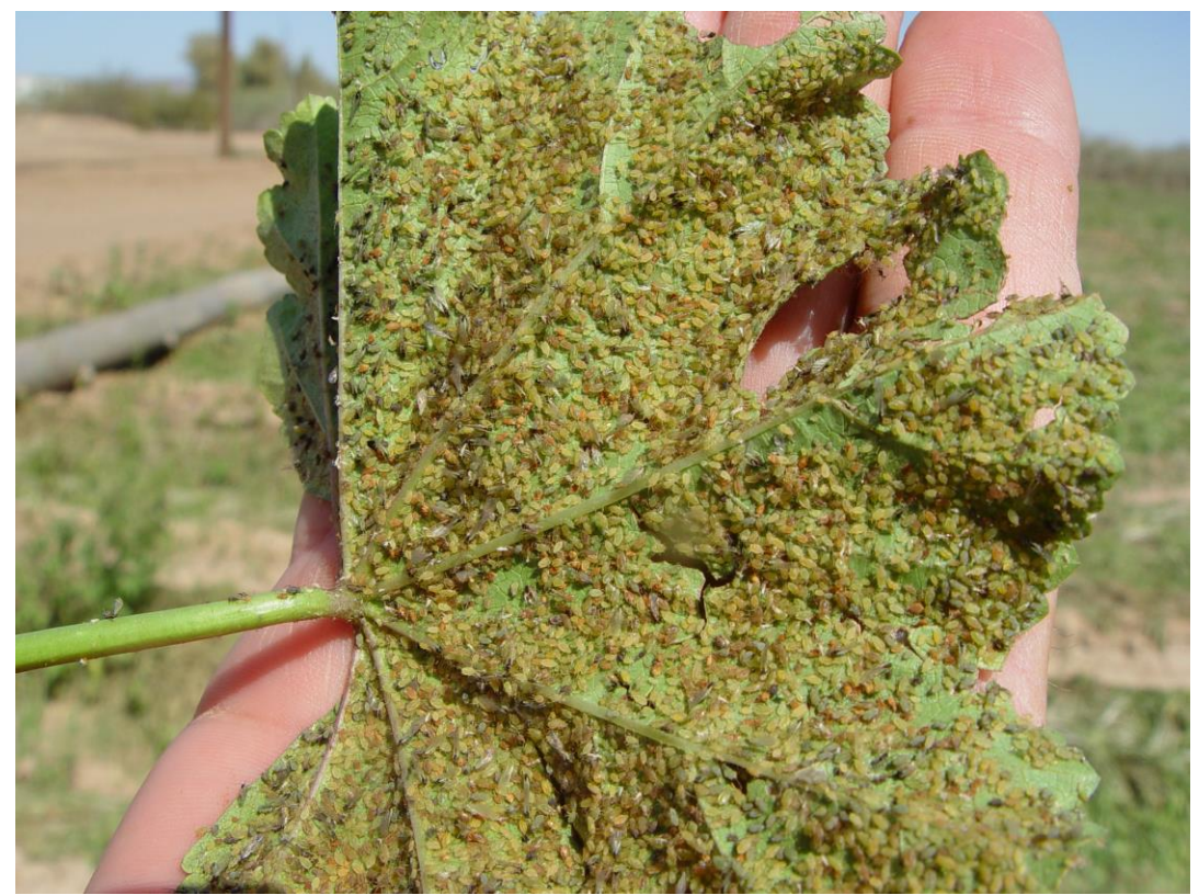
Figure 2. Green peach aphid infesting cheesweed found adjacent to a lettuce field.