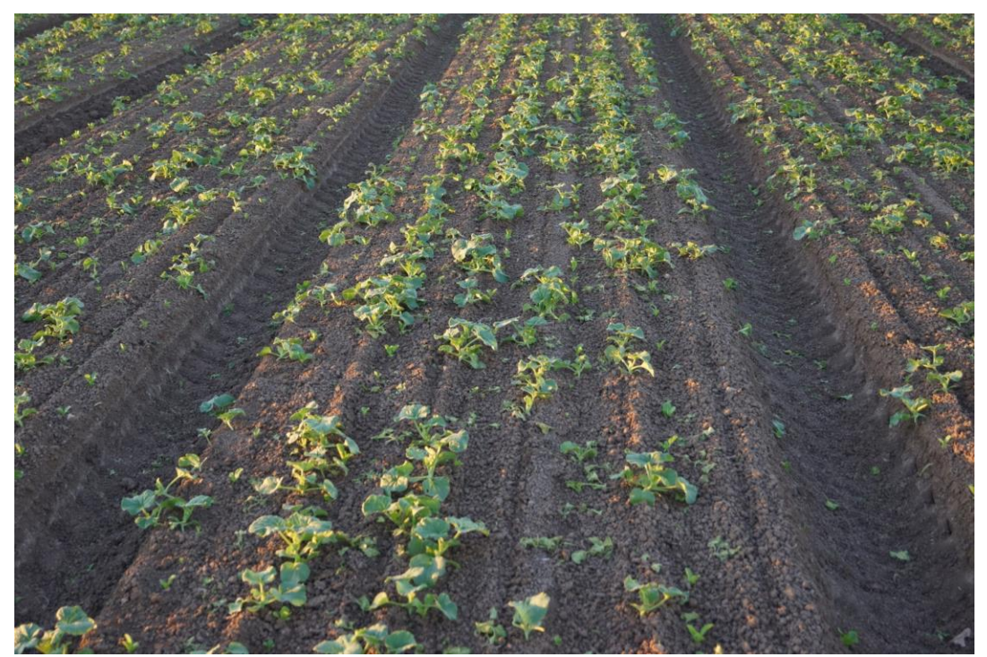
Figure 4. Volunteer cantaloupes infesting a direct-seeded lettuce field during stand establishment.