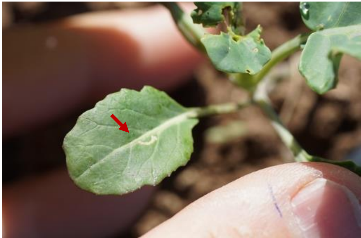
Figure 4. 1 st instar DBM larva mining in the leaf tissue in broccoli transplant.