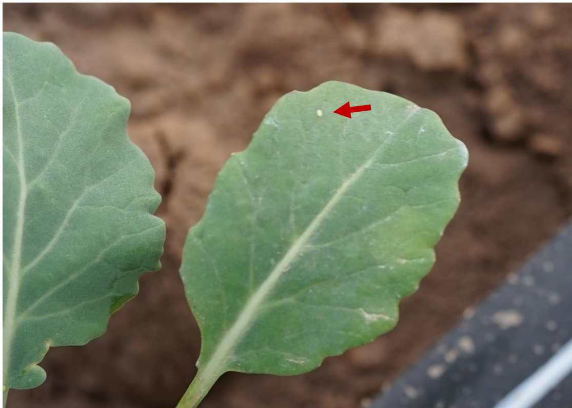
Figure 2. DBM egg on seedling cauliflower plant