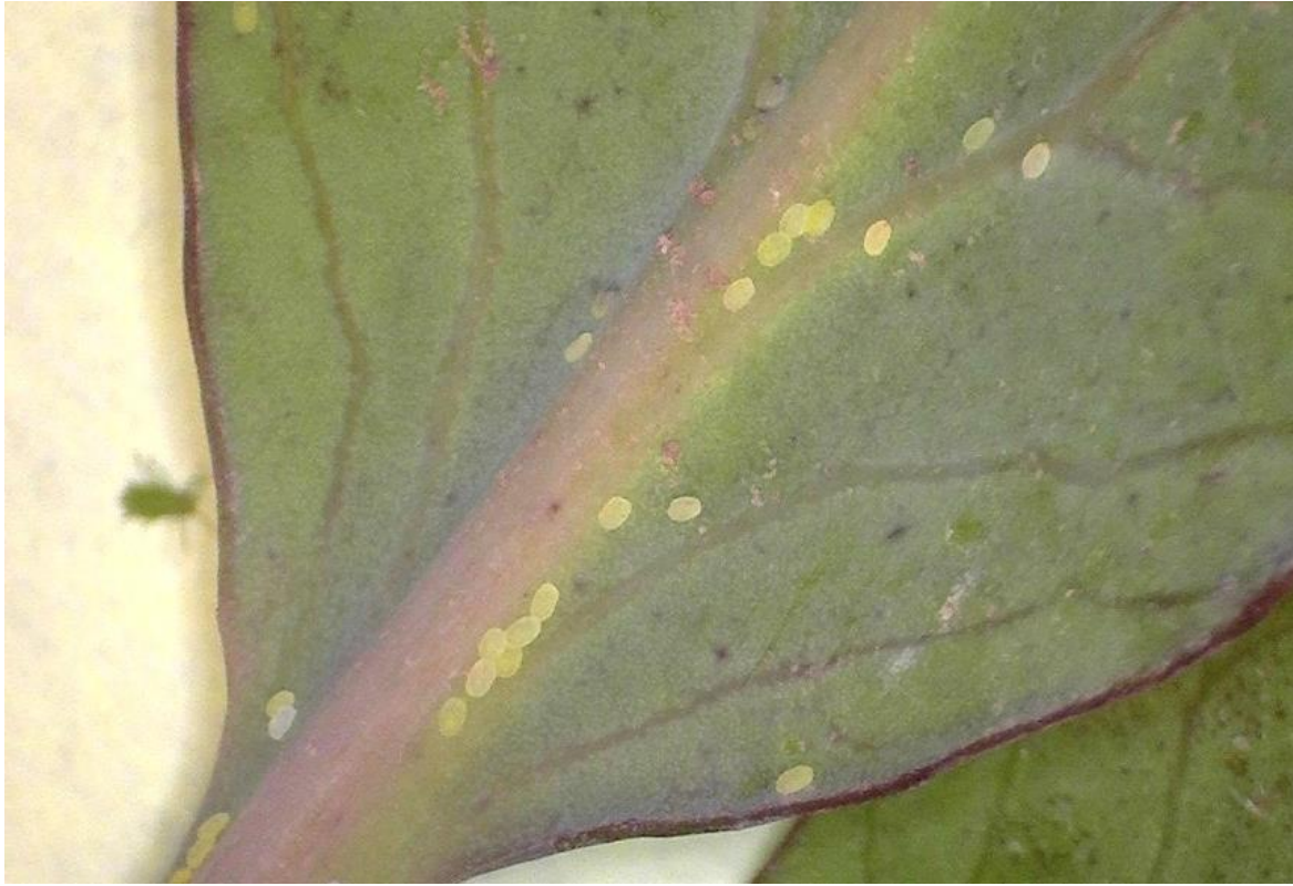
Figure 3. DBM eggs on cabbage transplant